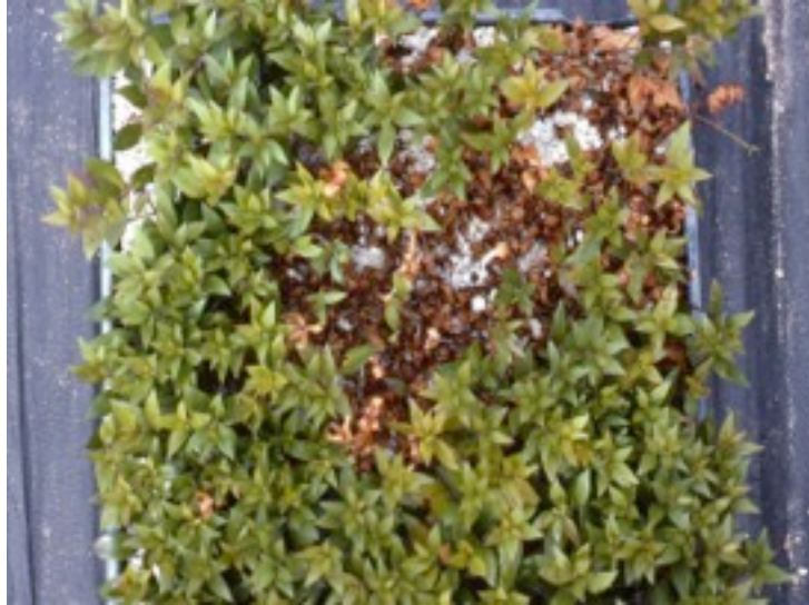
This is the result of Cylindrocladium leaf spot and cutting rot on myrtle which is grown as a cut foliage crop.

The last time the whole country reacted so violently to a new disease was daylily rust over 10 years ago. Now it is Boxwood blight. Bad news travels very and boxwood is an important and widely produced crop. The disease has now been reported in Rhode Island, Maryland, Massachusetts, Oregon and New York in addition to original finds and I am sure we can look forward to many more reports in the next few months. I have received so many requests for control strategies that I finally decided to see what I could do to help.