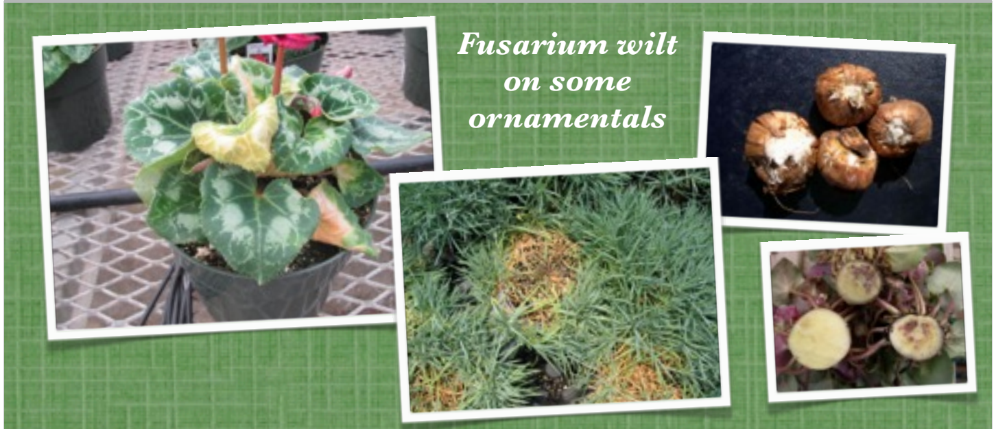
Fusarium wilt on some ornamentals